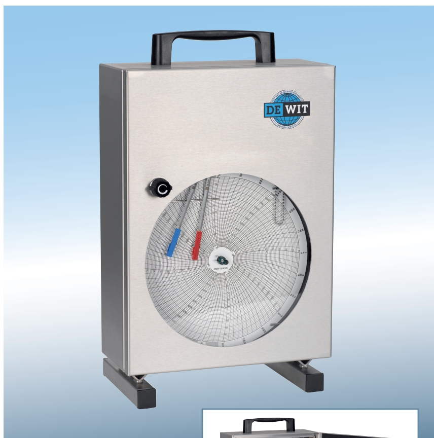
Rectangular 12" Chart Recorder De Wit model PP-12-T